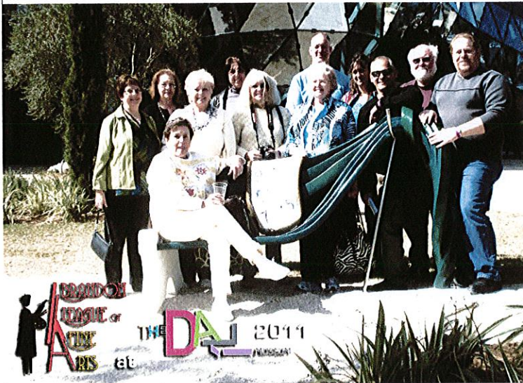
BLFA Dali Museum Trip.